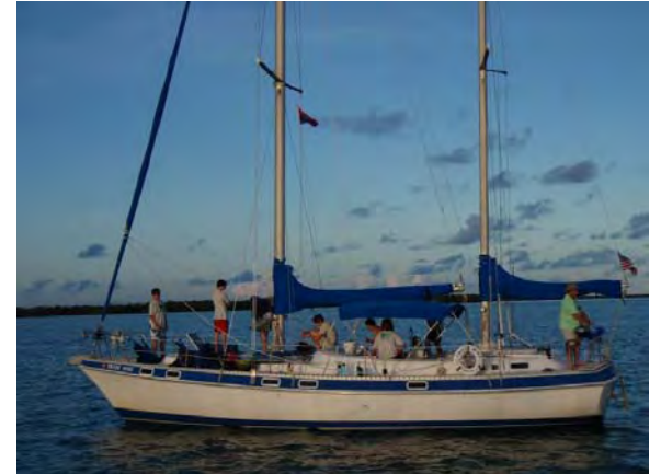
BSA National High Adventure Sea Base (FL), 2008