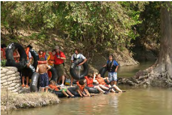
Guadalupe SP (TX), 2007