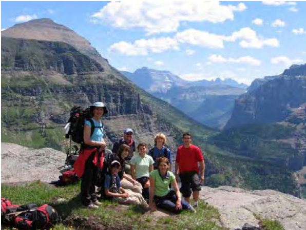
Glacier National Park (MT) 2005