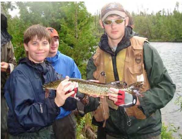
Boundary Waters (MN), 2005