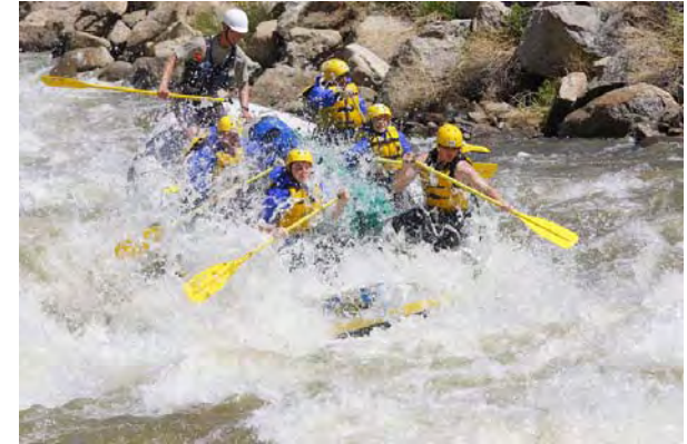
Arkansas River (CO), 2008

Summer Camp is an important event on every boy's June calendar. Troop 11 rotates between El Rancho Cima near Wimberly, Texas, Pirtle Scout Reservation in the Texas Piney Woods and Buffalo Trail Scout Ranch in the Davis Mountains of West Texas.