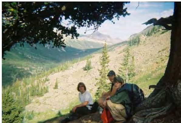
High Adventure: Climb Mt. Harvard 14,414 ft. (CO) 2006