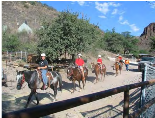
Summer Camp Buffalo Trails Scout Ranch (TX), 2006