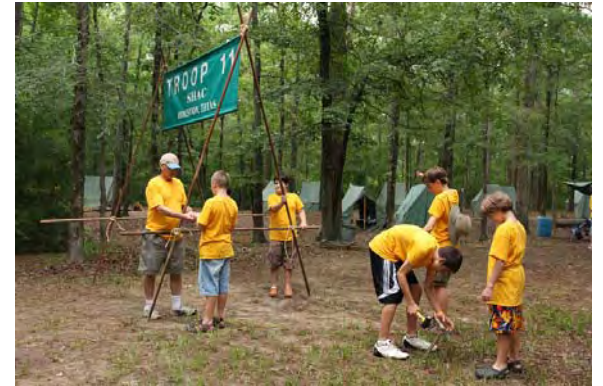
Summer Camp at Pirtle Scout Reservation (TX), 2008