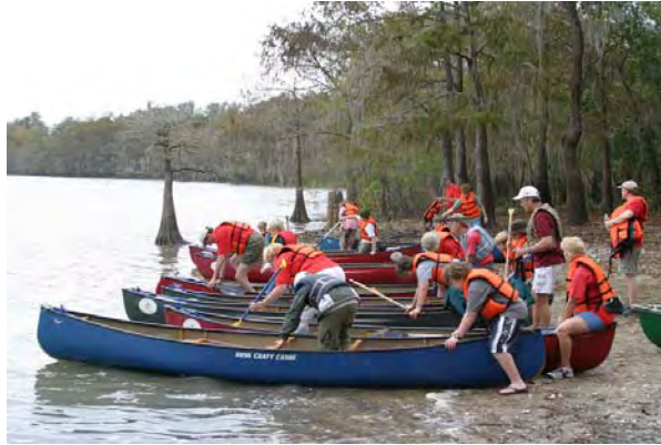
Lake Charlotte (TX), 2007