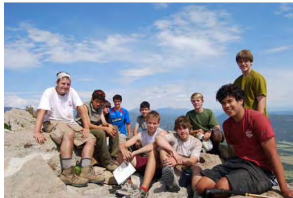
Tooth of Time, Philmont Scout Ranch (NM), 2007

High adventure trips during the summer are the ultimate goal of nearly every older boy who meets the age and rank requirements. Recent trips include Boundary Waters Canoe Area (MN), Philmont Scout Ranch (NM), Sea Base (FL) ocean adventure, White Water Rafting on Arkansas River (CO), backpacking in Yosemite Wilderness National Park (CA), Glacier National Park (MT), Mt. Harvard (CO), and Appalachian Trail (NC).